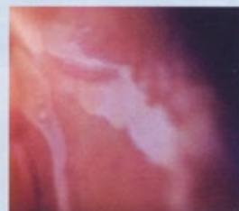
Under ViziLite illumination

ViziLite Plus ORAL LESION IDENTIFICATION AND MARKING SYSTEM